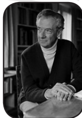
Benjamin Britten 1913-1976