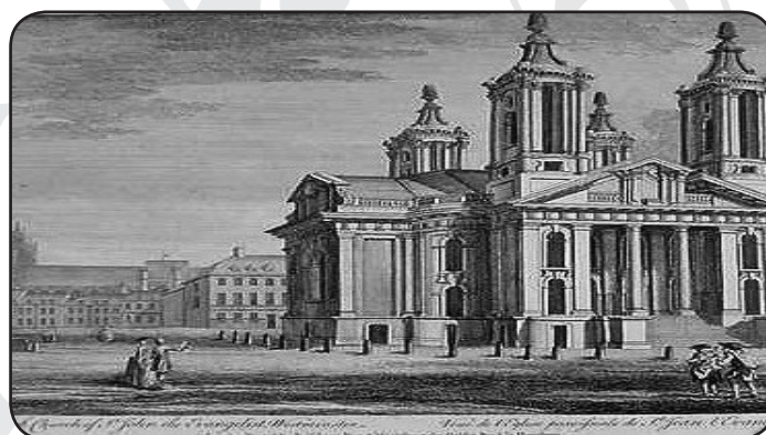
St. John's Smith Square 18th Century Engraving