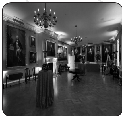
Picture gallery at Foundling Museum