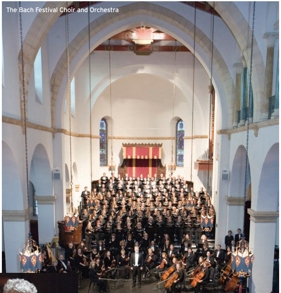
The Bach Festival Choir and Orchestra

The "Vegas Years" show that he's bringing to Central Florida "brings a com-