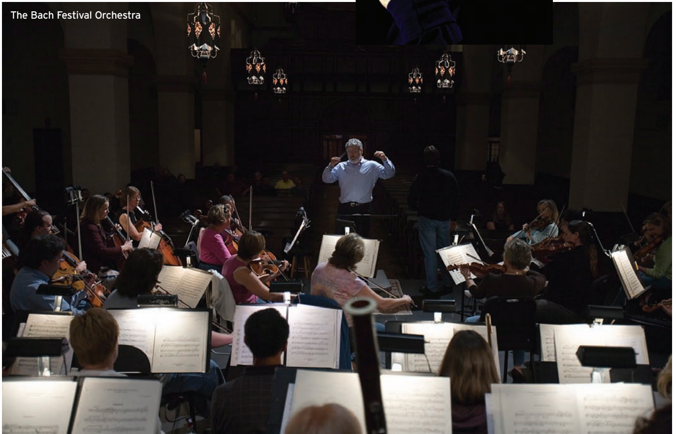
The Bach Festival Orchestra